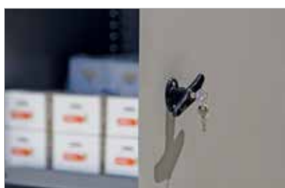
The doors include a lock with two keys.